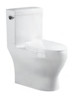
T-5000 Glenwynn™ Skirted