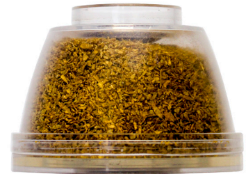
Internal Filtering Cartridge