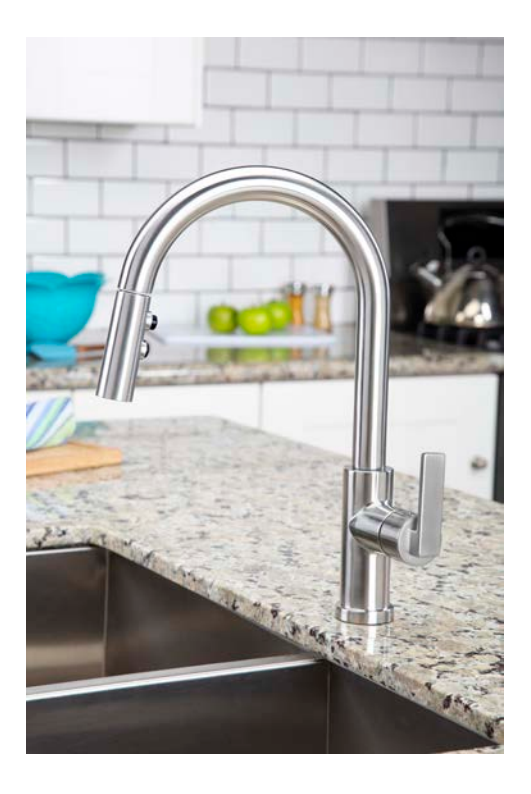
SENSOR FAUCETS available in SBS SKUs