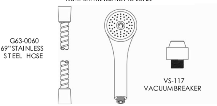
VS-100-PC HAND HELD SHOWER